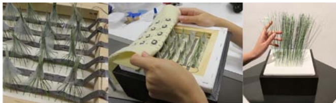
Fig. 4: Fiber optic bundles (left), LED matrix (middle), Light Pattern on Fiber optics (right)

Generally we installed three pots and sounds from nature, environment and human, were assigned to each grass pot. Each real Grass pot was connected with a different sound. A RGB LED matrix was used for LED patterns, with 60 RGB LEDs connected to 60 small bundles of fiber optics (Figure 4, left). Light patterns are projected to the LED matrix connected to one end of the fiber optic bundles (Figure 4, middle). The lights on the tips of the fiber optic grass are illuminated depending on the way how participants touch Grass (Figure 4, right).