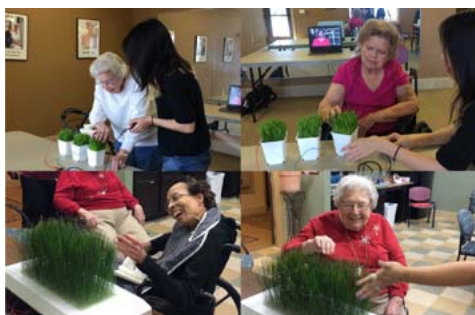
Fig. 5: Older adults in an assisted living facility experience real Grass (top) and fibr optic Grass (bottom).

We conducted a preliminary study with older adults. We visited one of the local assisted living facilities in Bryan, Texas. We summarize our results with three visits to the facility. Each visit, the audience was 5-7 senior citizens. Some were on wheelchairs, while others used walkers. For this study, we could use only sound feedback from Grass because the environment was too bright for LED patterns to be appreciated properly. The elderly required simple instruction in order to perform the interaction. As well, due to the project being propped on a table, those that were in wheelchairs were at a disadvantage and were difficult to touch Grass freely. Since Grass had only sound interactions, the general setup was just fine for senior residents.