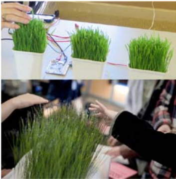
Fig. 1. Real Grass (Top) and Fiber Optic Grass (Bottom)

Grass investigates how touch-sensitive interactive plants can evoke an emotional attachment with the user and how the relationship affects their quality of life. Since Grass used real grass as well as a designed grass, we carefully chose plants based on scientific evidences and aesthetic qualities. We aim for the level of touch to be not only beneficial to human as it generates soothing feelings but also beneficial to plants as it generates plant defense system to be more alert to foreign pathogens.